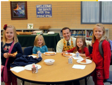
Lunch with Principal