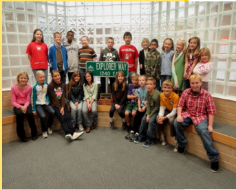
Wheel of Fortune Winners