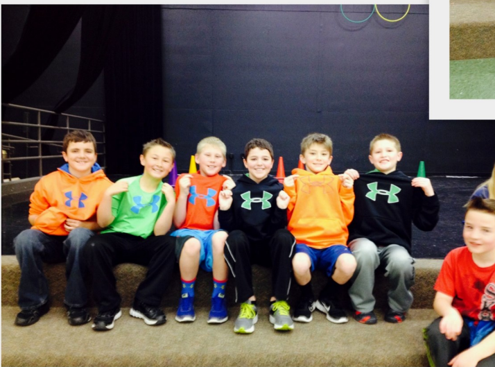
Left: Photo of "team under armer"